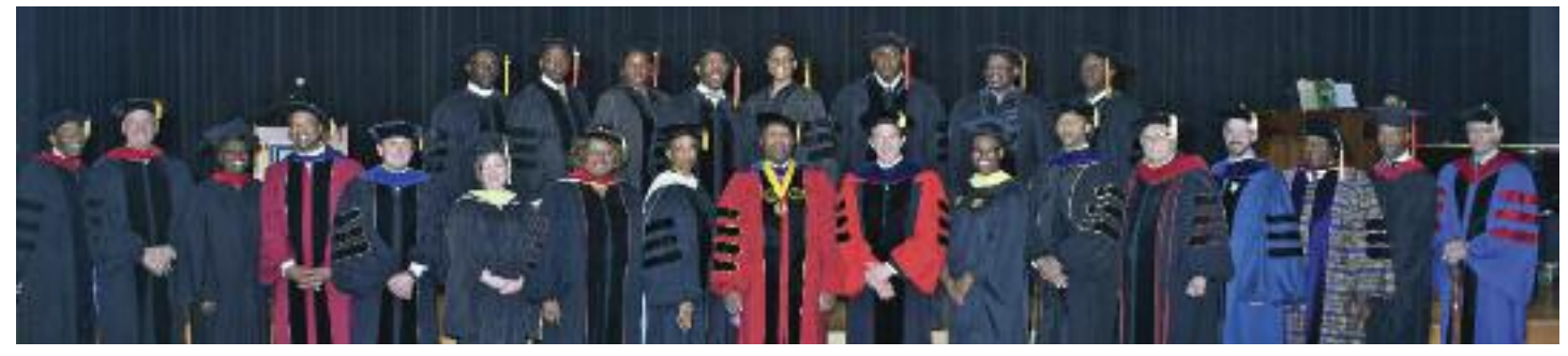
2016 Doctor of Ministry Graduates and Faculty