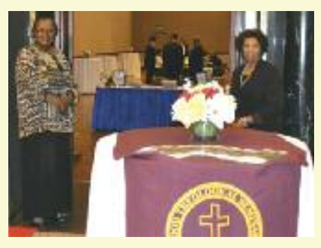
HTS welcomed alumni, students and prospective students at a reception hosted during the 2016 A.M.E. Zion General Conference in Greensboro in July.