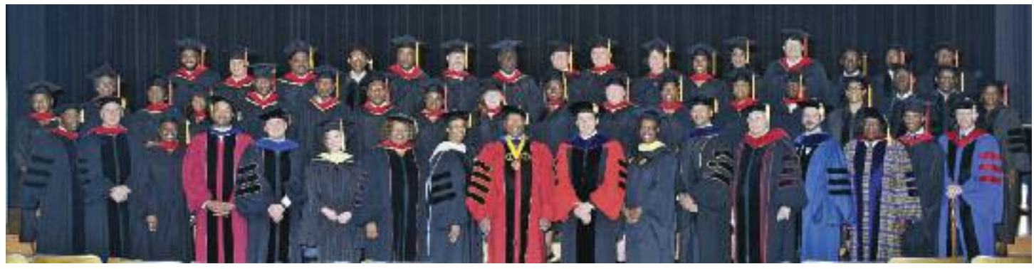
2016 Master of Divinity and Master of Theological Studies Graduates and Faculty