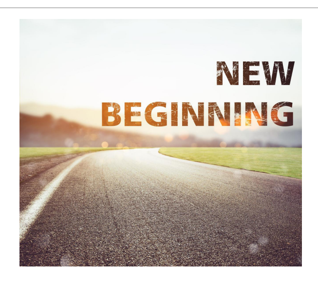
New at Hood

We will be closed for the Thanksgiving Holiday beginning Wednesday, November 22nd - Friday, November 25th. Offices will re-open on Monday, November 27th.